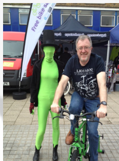
Backing Cycle South Brum to get lottery funding

Calling on the Government to secure the future of Balaam Wood Academy in Frankley with key rebuilding works