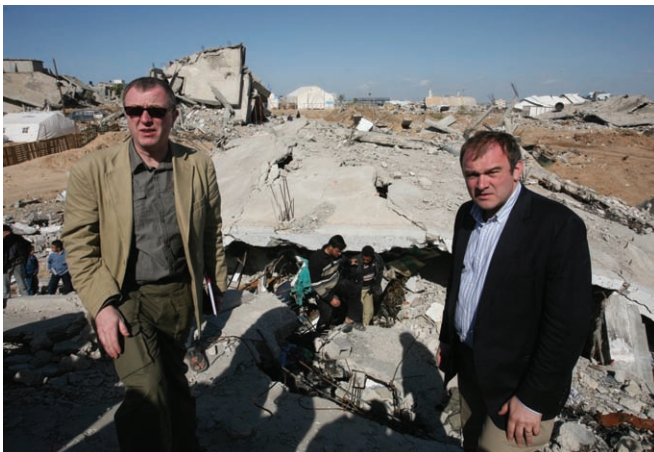
Richard Burden MP and Ed Davey MP in Izbit Abed Rabbo, Gaza

Izbit Abed Rabbo lies less than 1 km from Israel, and when the delegation visited on 16th February, not a single building in the town of 5,000 inhabitants had been left standing. The town came under continued aerial bombardment, before Israeli ground forces dynamited the homes and used bulldozers to flatten any remaining buildings. Residents told the delegation that 200 people had been killed in the town. Many of the town’s inhabitants are now living in tents near to the rubble of their former homes, with 90 percent relying on the UNRWA Food Distribution Centre nearby.